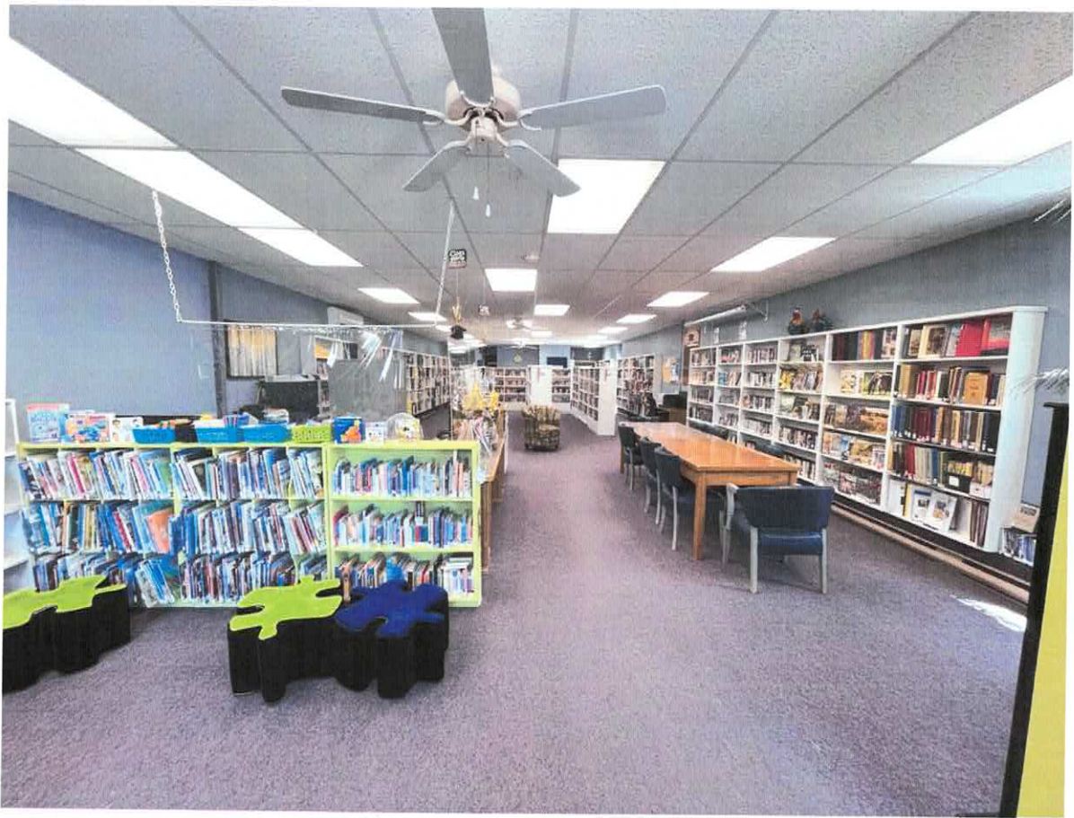
Above photo: Melita Library